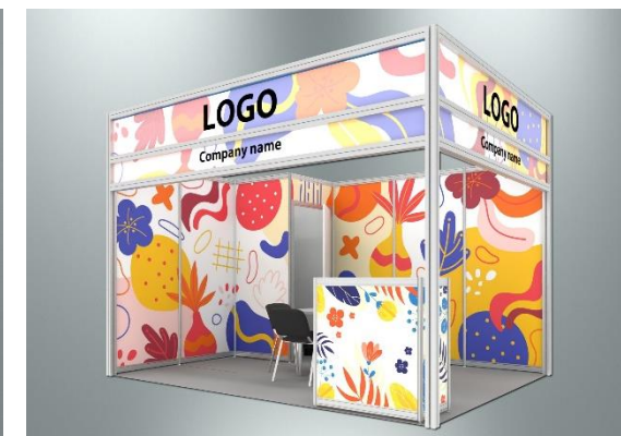
Example of stand with full-color walls design (additional service)