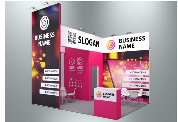
Example of stand with full-color walls design (additional service)