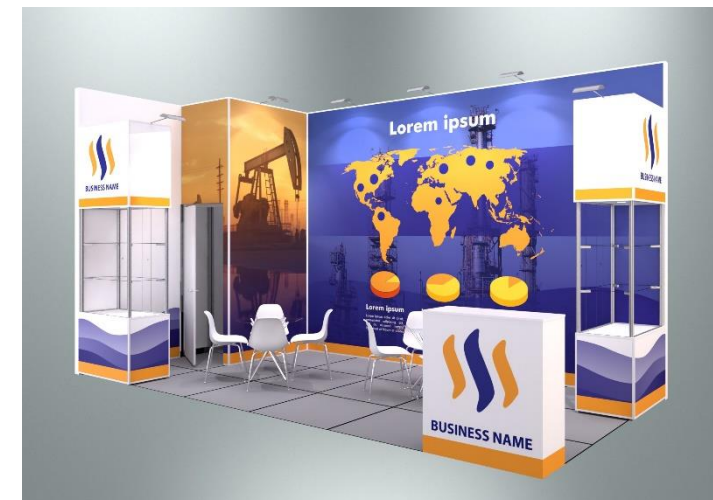
Example of stand with full-color walls design (additional service)