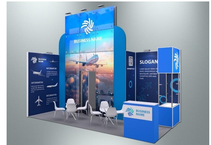
Example of stand with full-color walls design (additional service)