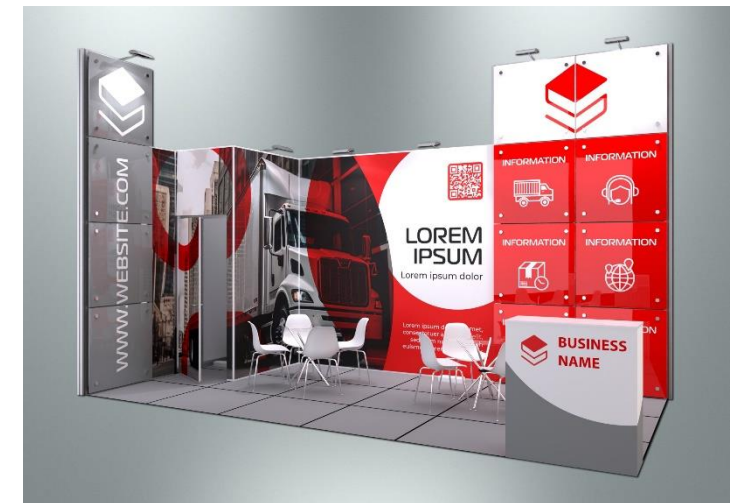
Example of stand with full-color walls design (additional service)