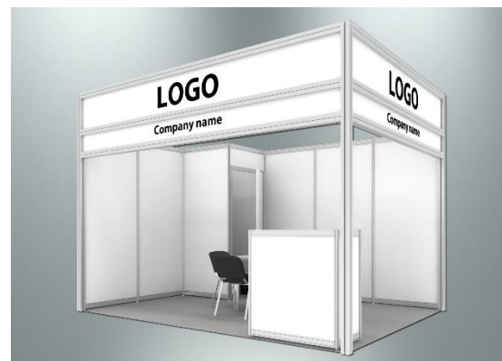
Example of standard stand design

Stand will be located near key exhibitors, what provides best visitor traffic